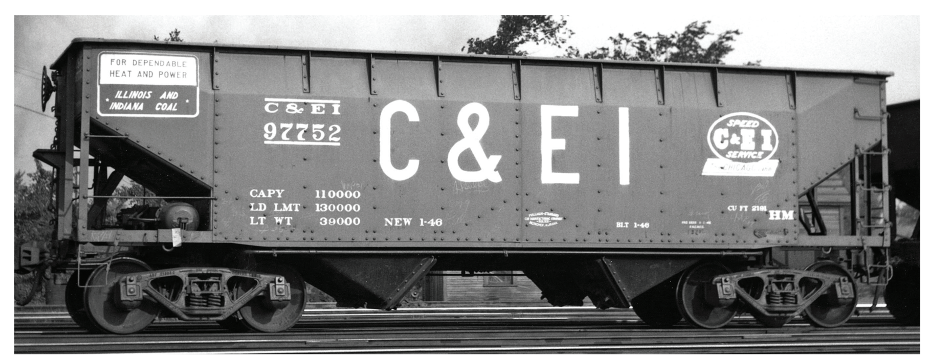
C&EI 97752, New 1-46, Zanesville, OH, August 10, 1946